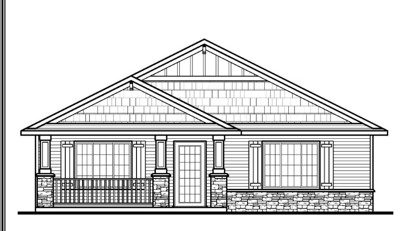
**Some Options May Be Shown